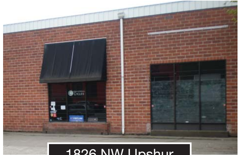
1826 NW Upshur