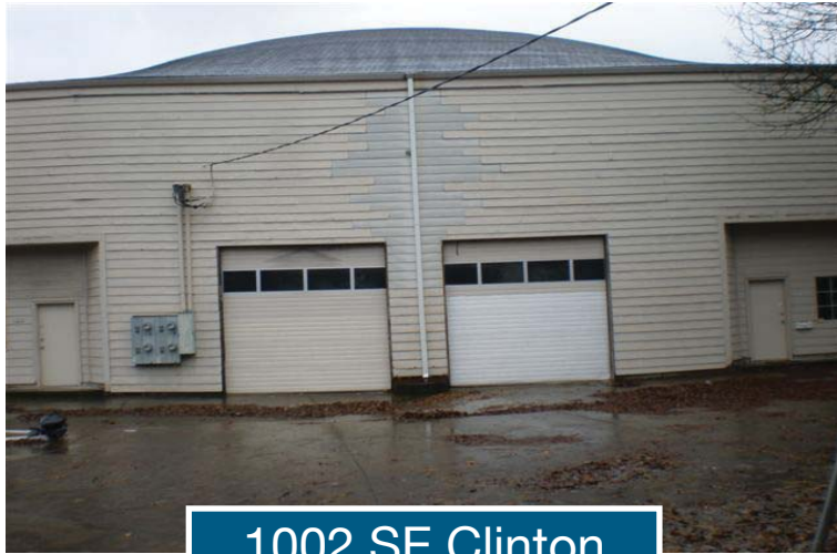
1002 SE Clinton