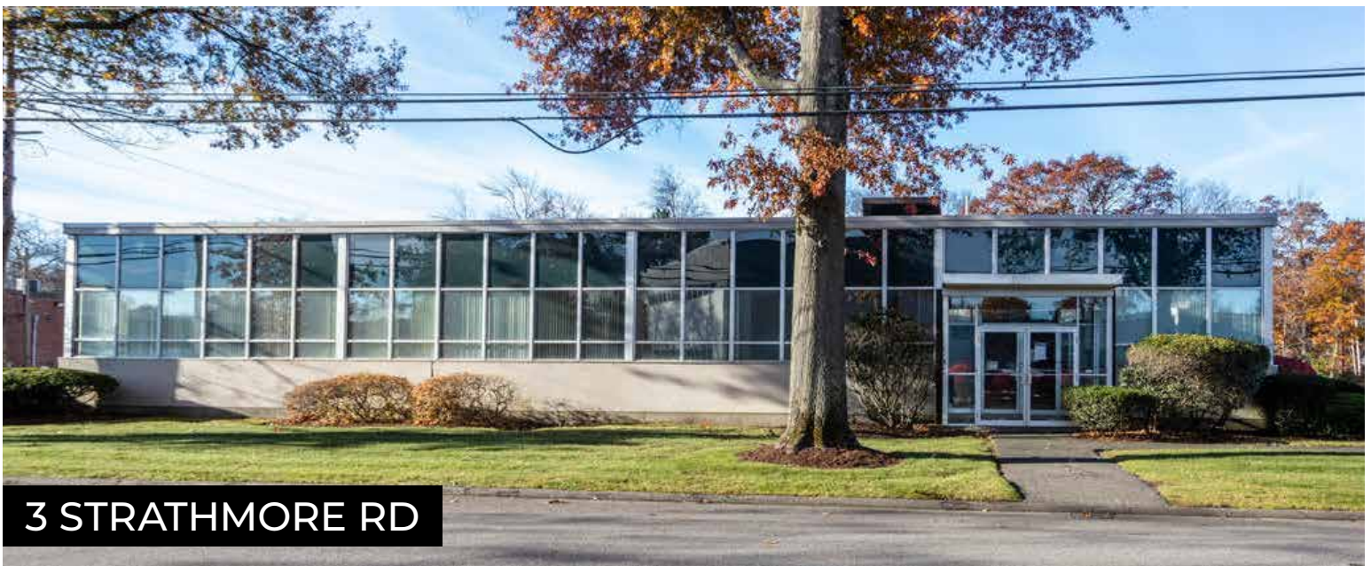
3 STRATHMORE RD