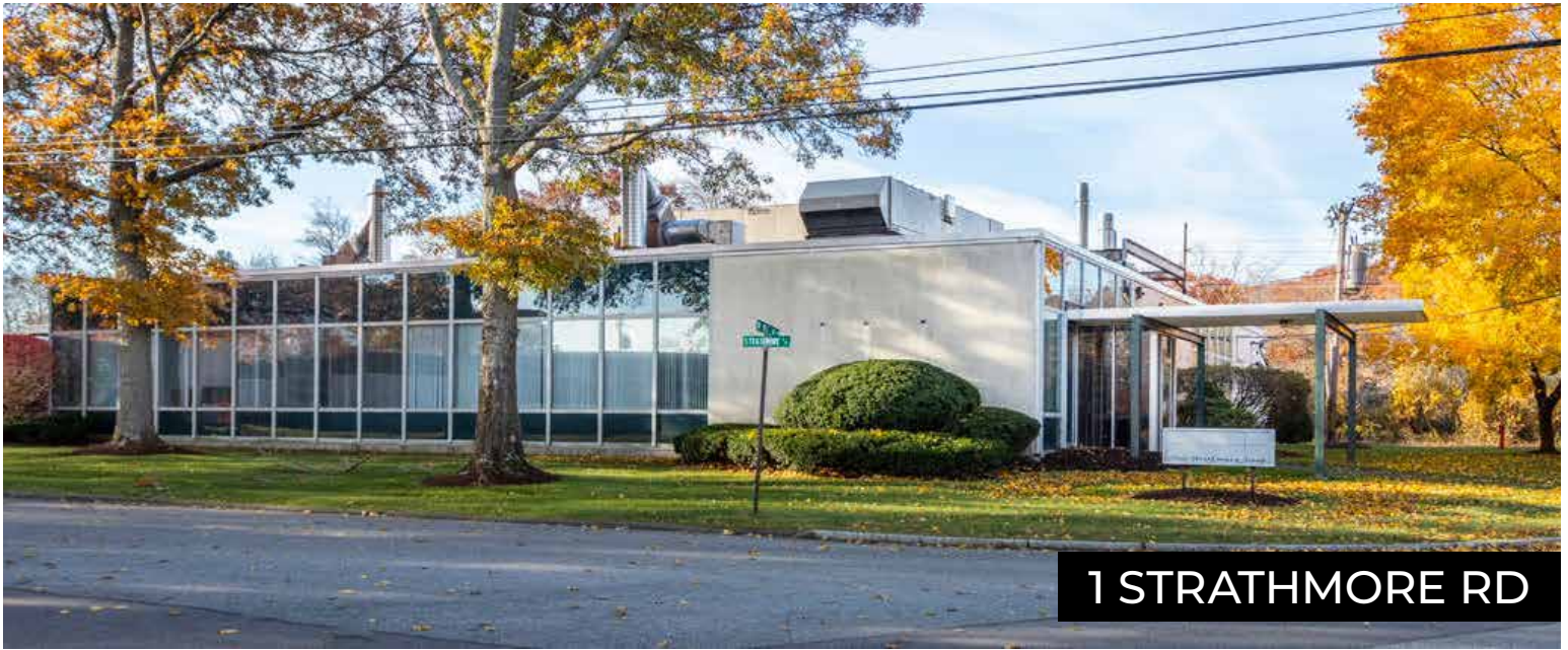
1 STRATHMORE RD