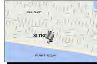
VICINITY MAP SCALE: NONE

ROBERTSON LOIA ROOF ARCHITECTS & ENGINEERS 3460 Preston Ridge Road - Suite 275 - Alpharetta, Georgia 30005 770-674-2600 Fax 678-319-0745