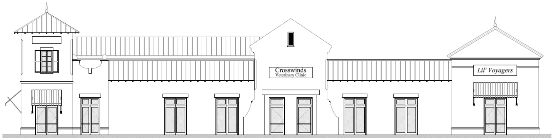
BUILDING 300 - EAST ELEVATION