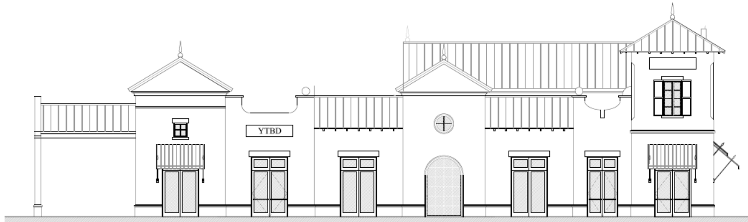
BUILDING 300 - SOUTH ELEVATION