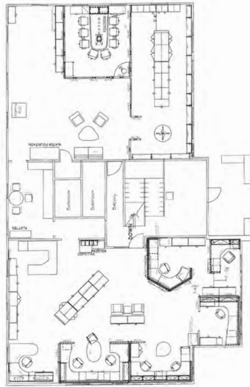
2nd Floor (Vacant)