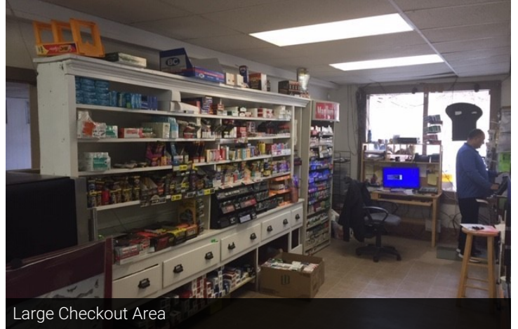
Large Checkout Area