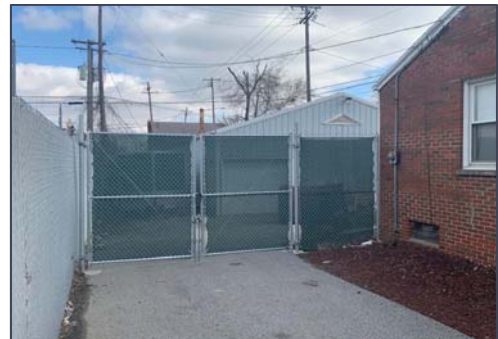
Security gate & fence