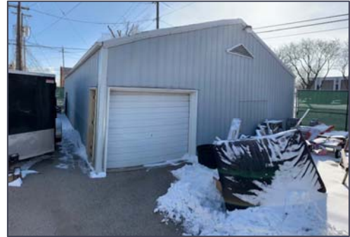
Rear shop with overhead door