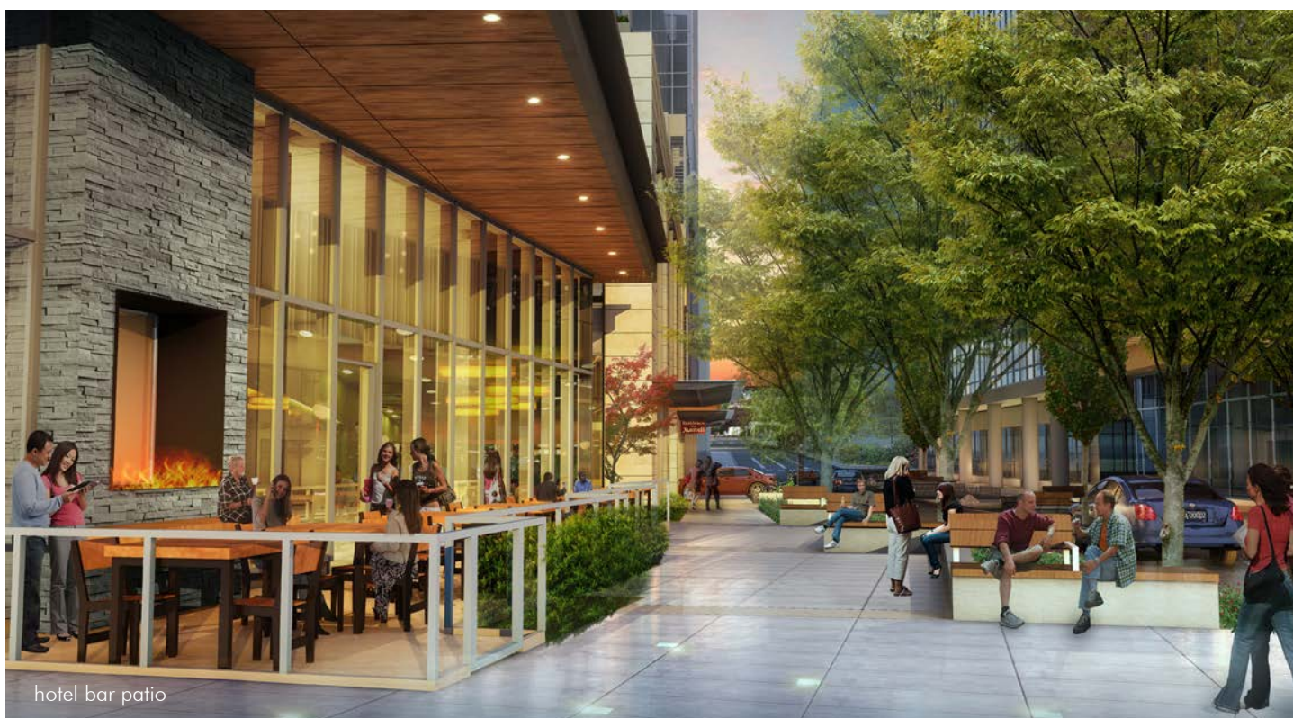
hotel bar patio