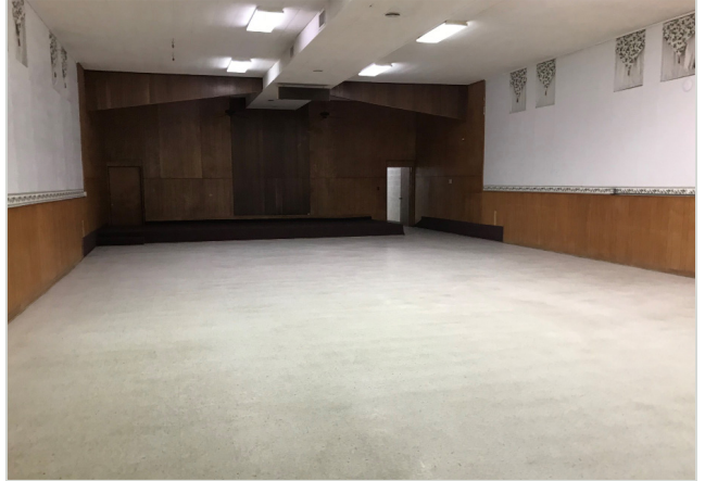
Large Fellowship Hall