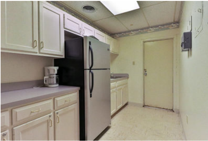
Not included in square footage