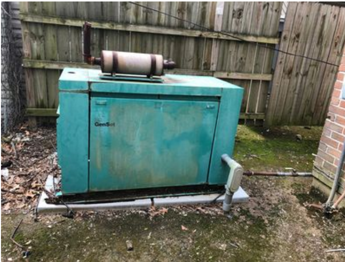
Serves entire suite including A/C