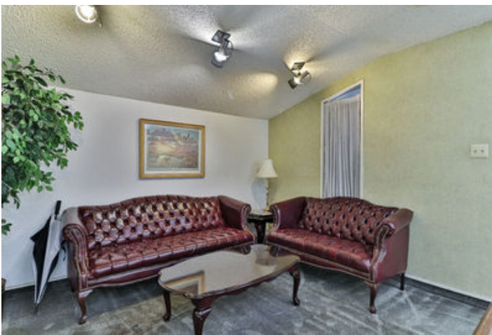
Not included in square footage.