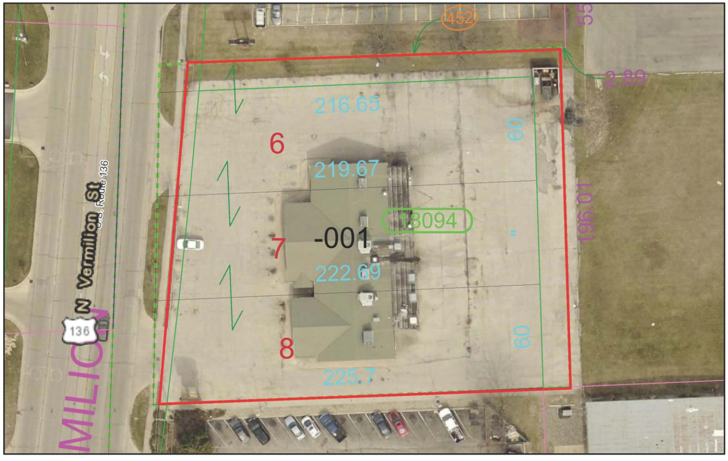
May 8, 2020