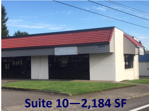
Suite 10—2,184 SF