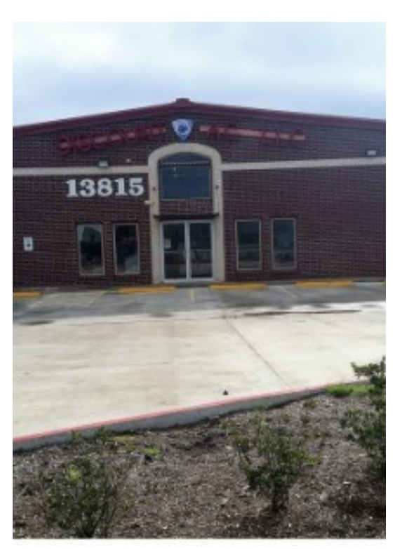
Murphy Rd - Stafford 13815 Murphy Rd, Stafford, TX 77477