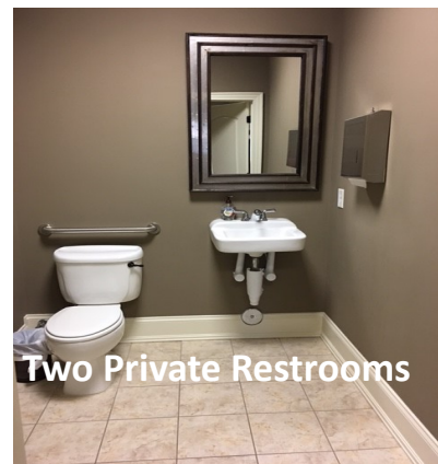
Two Private Restrooms