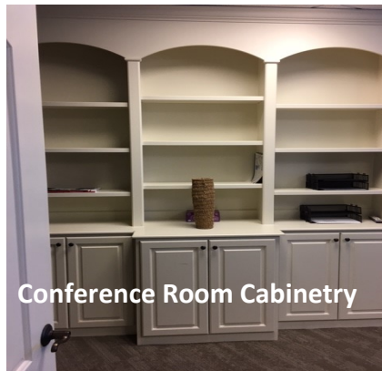
Conference Room Cabinetry