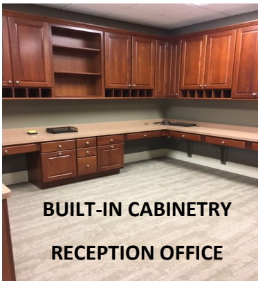
BUILT-IN CABINETRY RECEPTION OFFICE