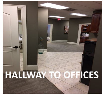
HALLWAY TO OFFICES