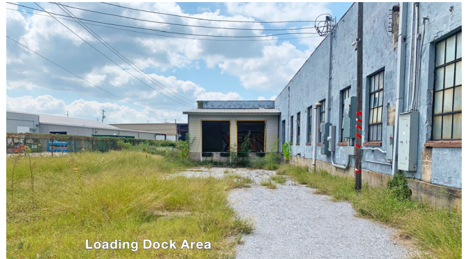
Loading Dock Area