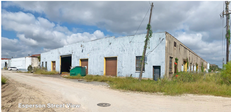
Esperson Street View