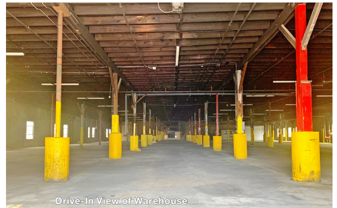
Drive-In View of Warehouse