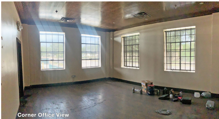
Corner Office View