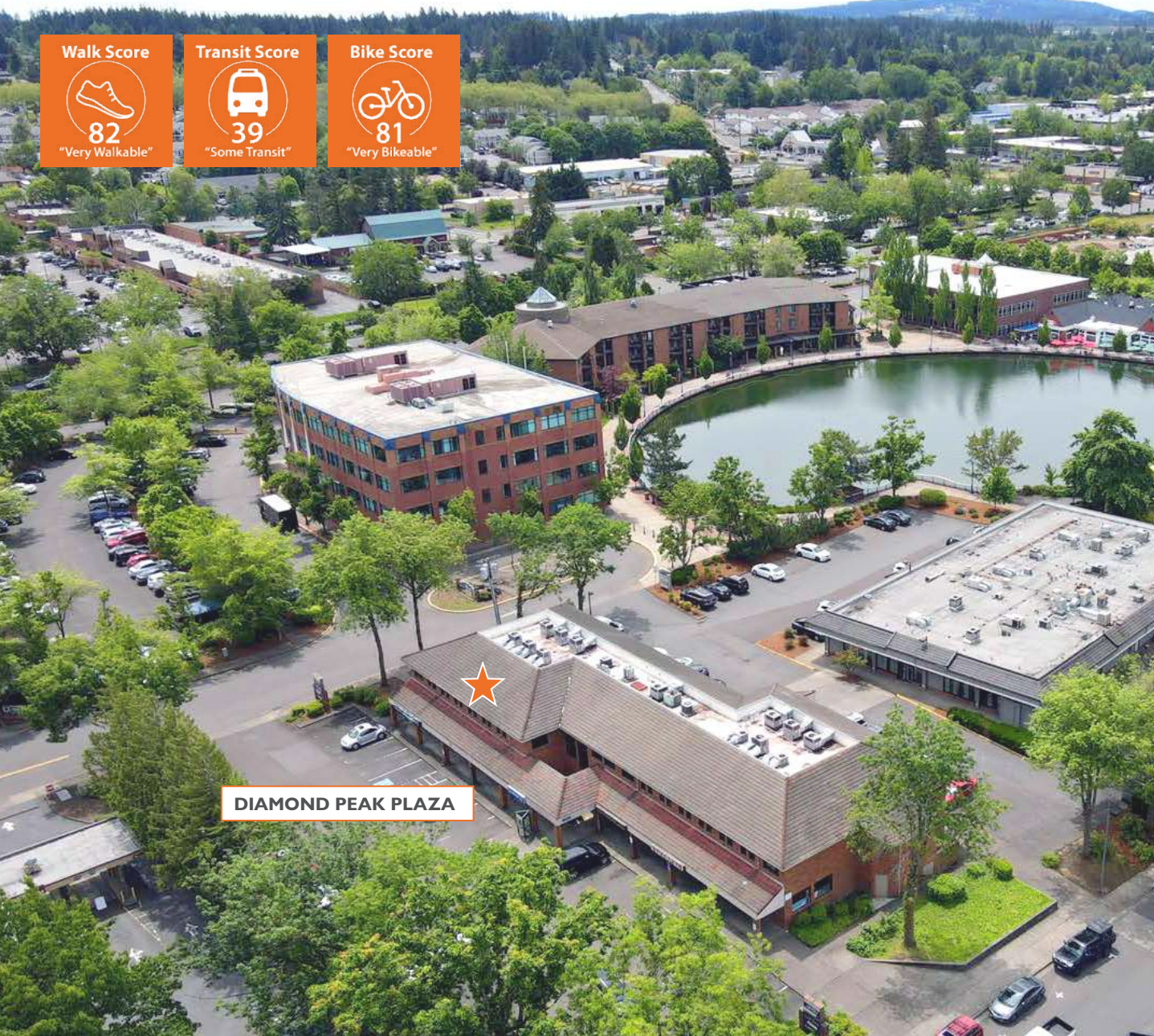
DIAMOND PEAK PLAZA