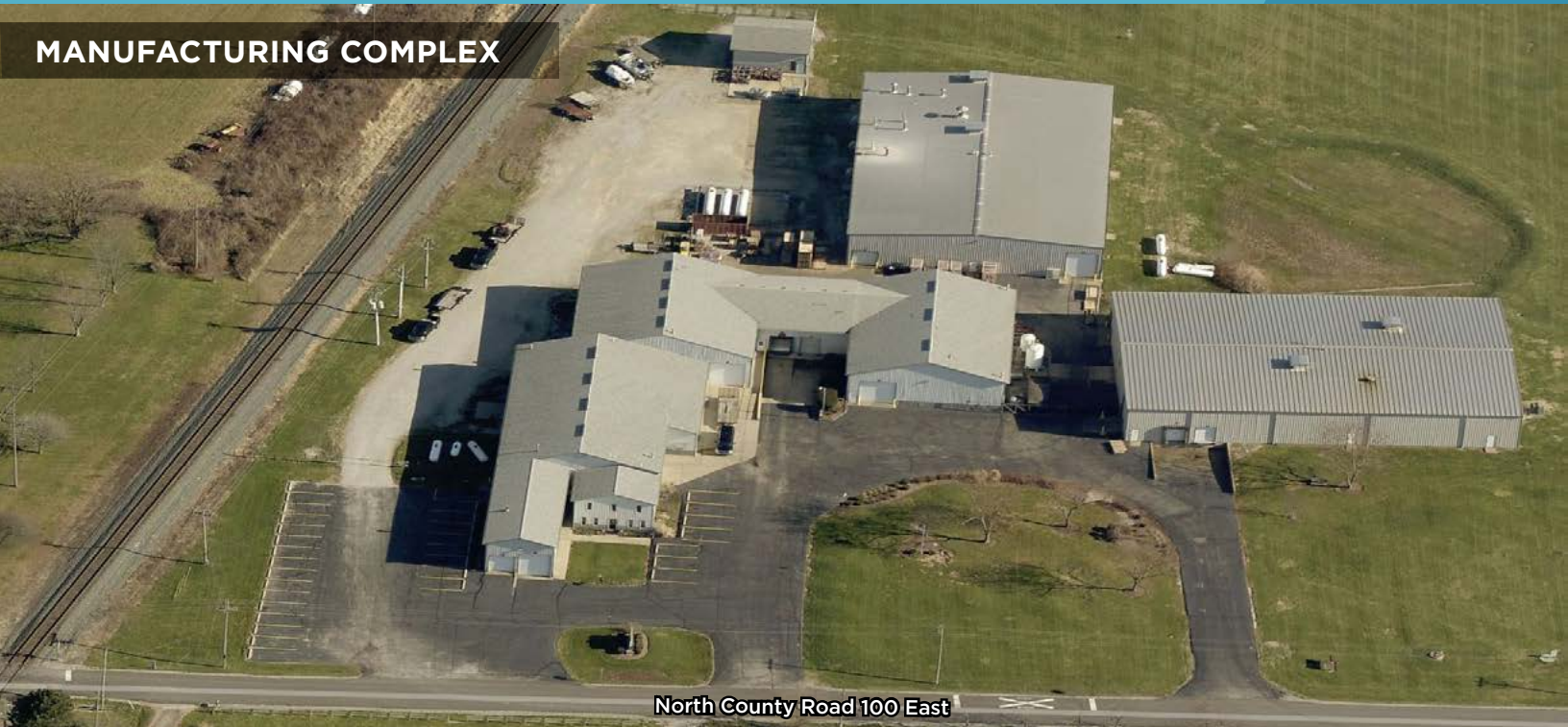
North County Road 100 East