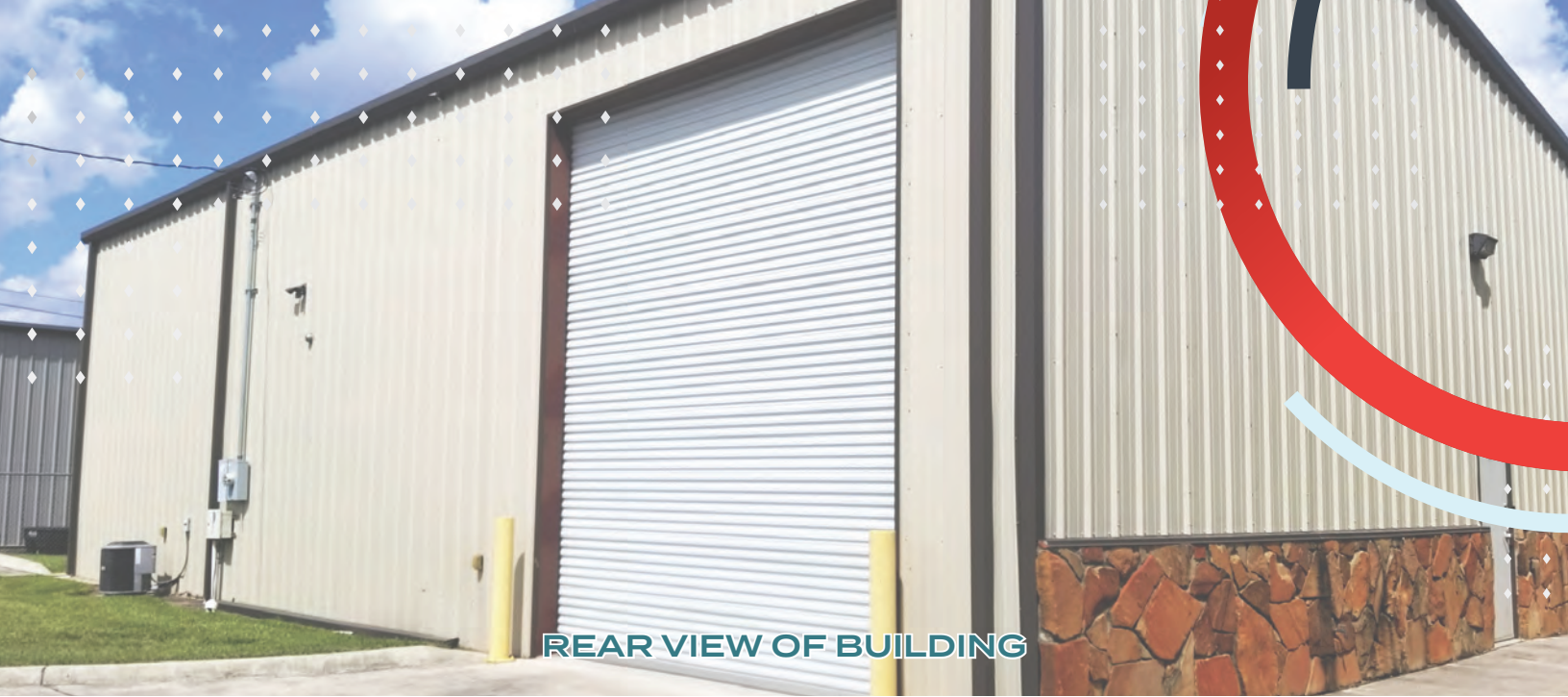
REAR VIEW OF BUILDING