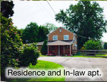
Residence and In-law apt.