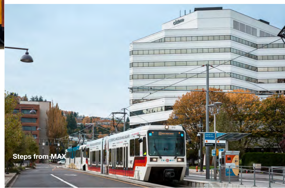
Steps from MAX