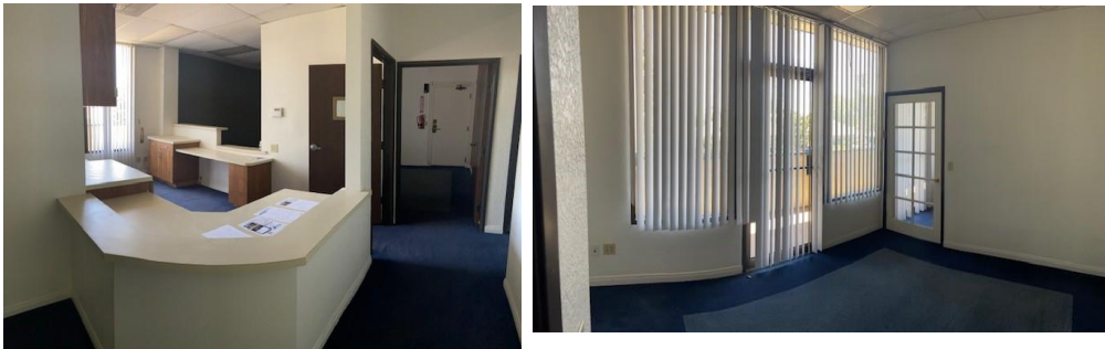
Suite 2A 2,609 sf