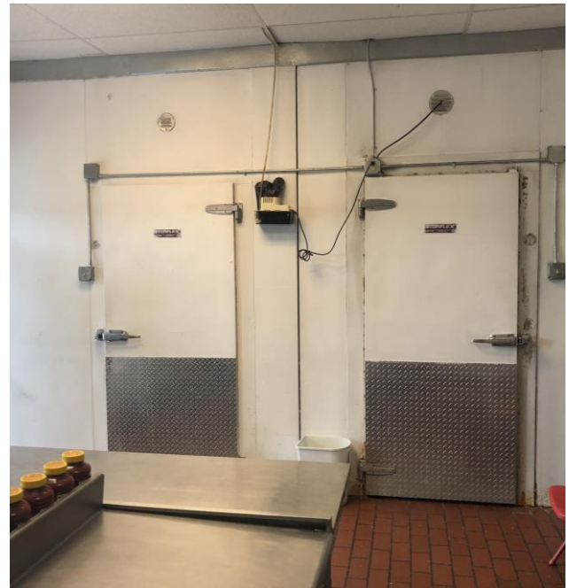
Walk-in Cooler and Freezer