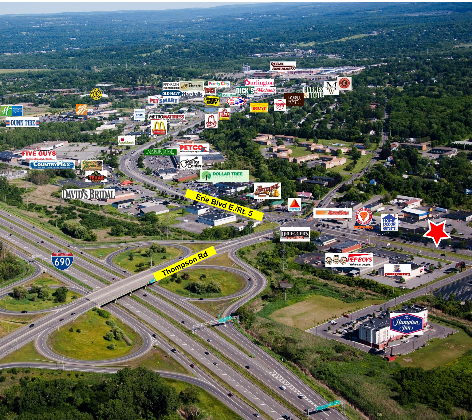
ERIE BLVD RETAIL CORRIDOR – VIEW LOOKING EAST