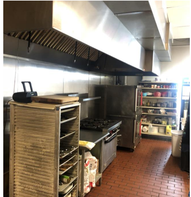
Hood ANSUL System