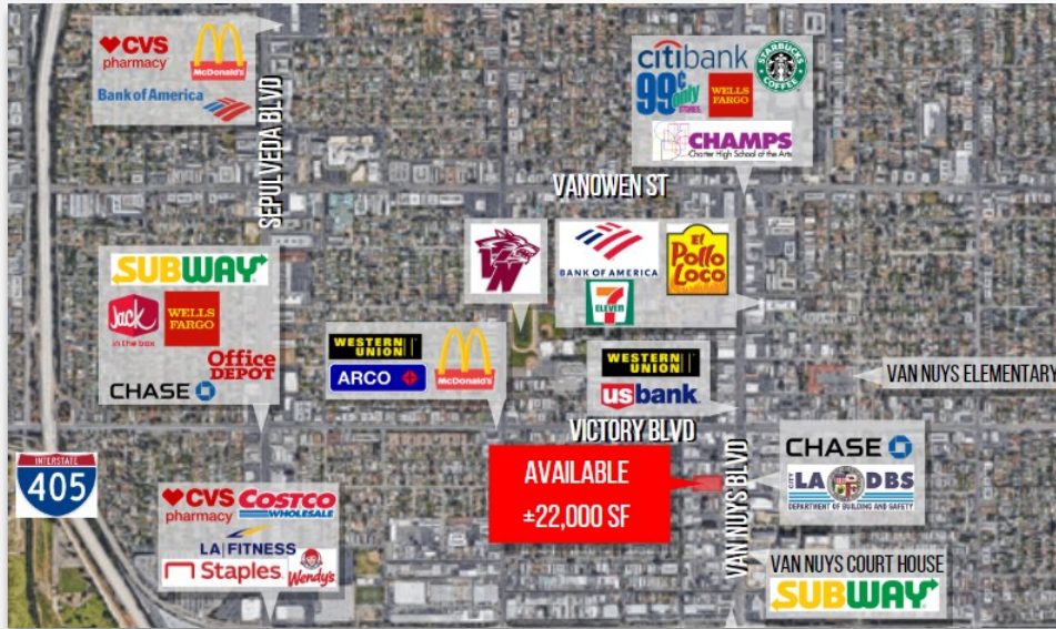
TRADE AREA AERIAL

14519-14539 Sylvan St., Van Nuys, CA 91411