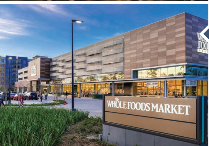
WHOLE FOODS MARKET®