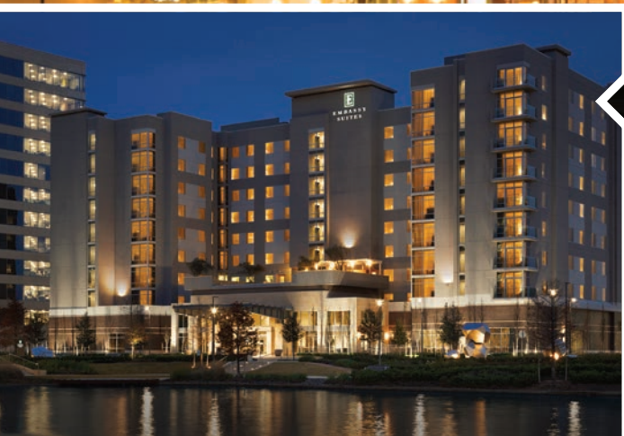
EMBASSY SUITES BY HILTON