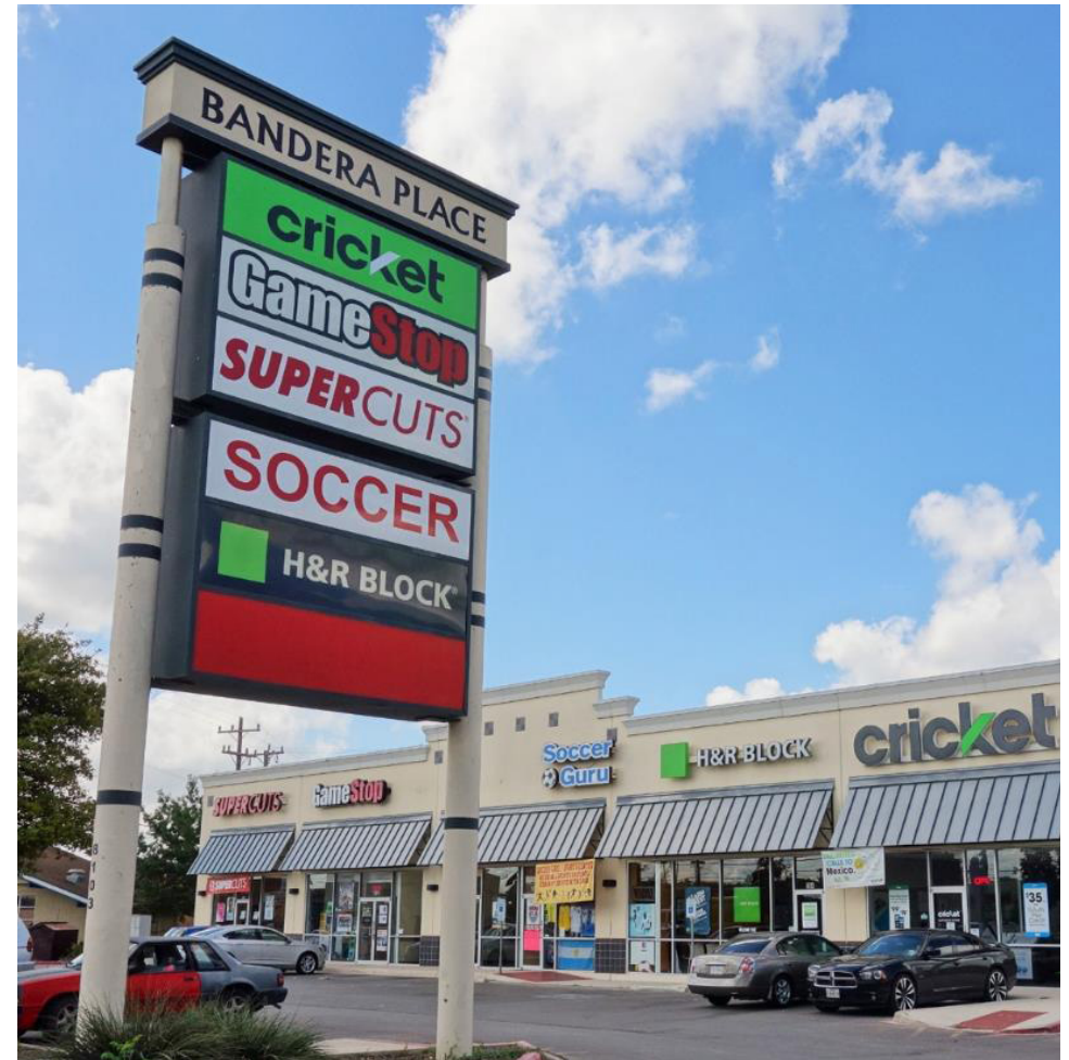
LARGE PYLON SIGN LOCATED ALONG BANDERA ROAD

Walmart, HEB, Big Lots, Dollar Tree, McDonald's, Starbucks