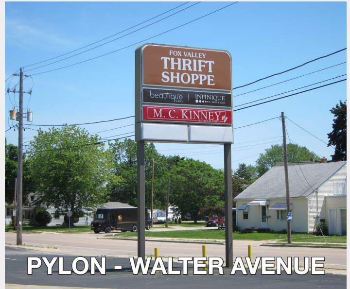
PYLON - WALTER AVENUE