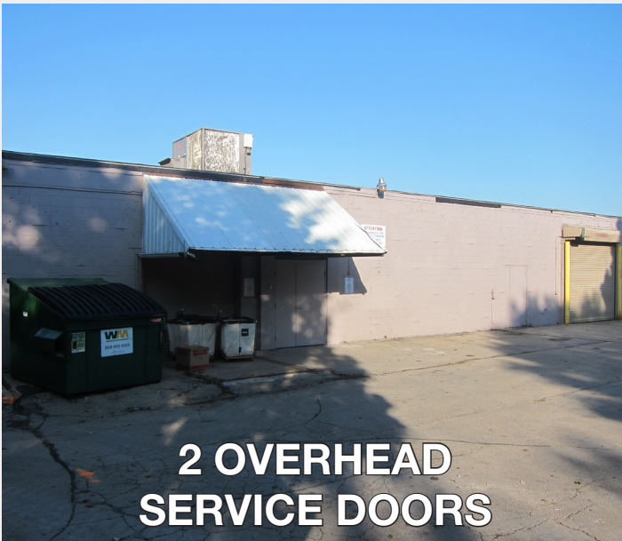
2 OVERHEAD SERVICE DOORS