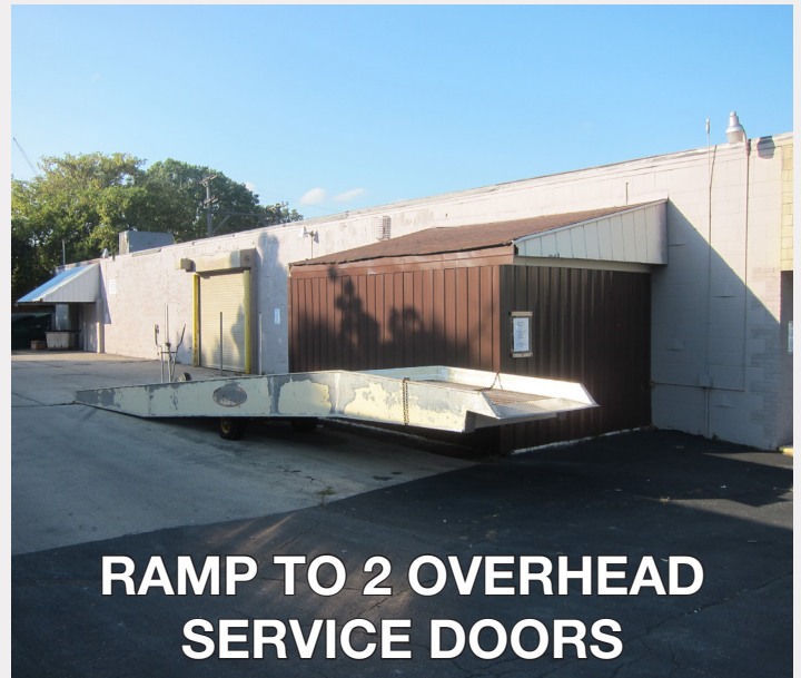
RAMP TO 2 OVERHEAD SERVICE DOORS