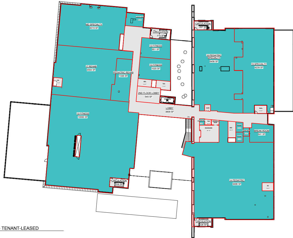
① LEVEL 2 - TENANT-LEASED 1/16" = 1'-0"

DISCLAIMER: THIS SITE PLAN SHOWS THE APPROXIMATE LOCATION, SQUARE FOOTAGE, AND CONFIGURATION OF THE FACILITY, AND IS ONLY ILLUSTRATIVE OF THE SIZE AND RELATIONSHIP OF THE SUITES AND COMMON AREAS GENERALLY, ALL OF WHICH ARE SUBJECT TO CHANGE. THE SHOWING OF ANY NAMES OF TENANTS, SQUARE FOOTAGE, SHALL NOT BE DEEMED TO BE A REPRESENTATION OR WARRANTY THAT ANY TENANTS WILL BE AT THE FACILITY, THE SQUARE FOOTAGE IS ACCURATE DO OR WILL CONTINUE TO EXIST.