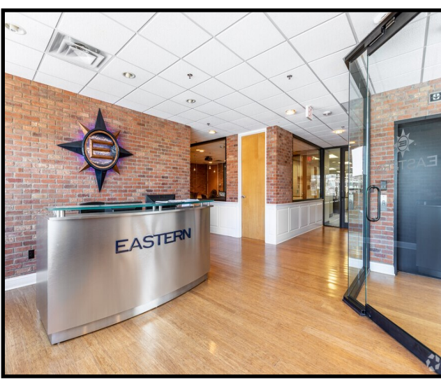
Ideal for any professional office use. Beautiful light and bright office space in great Commerce Park location near shopping, restaurants, and hotels. Easy access to Route 6, Route 7 and I84.