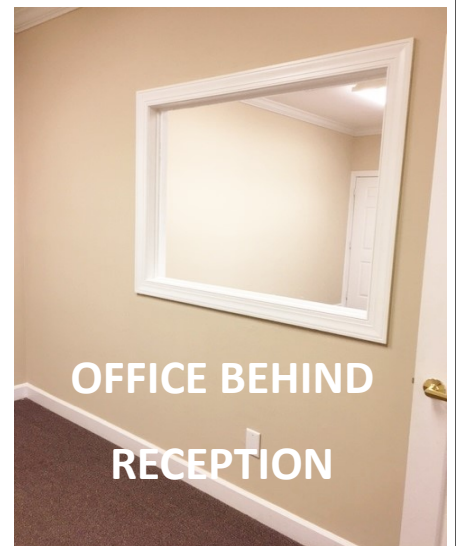
OFFICE BEHIND RECEPTION