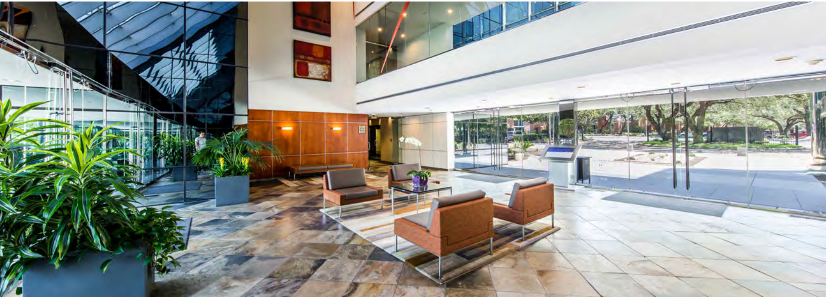
Top: Common area with furniture and relaxing elements; Bottom: Building lobby with seating and digital tenant directory