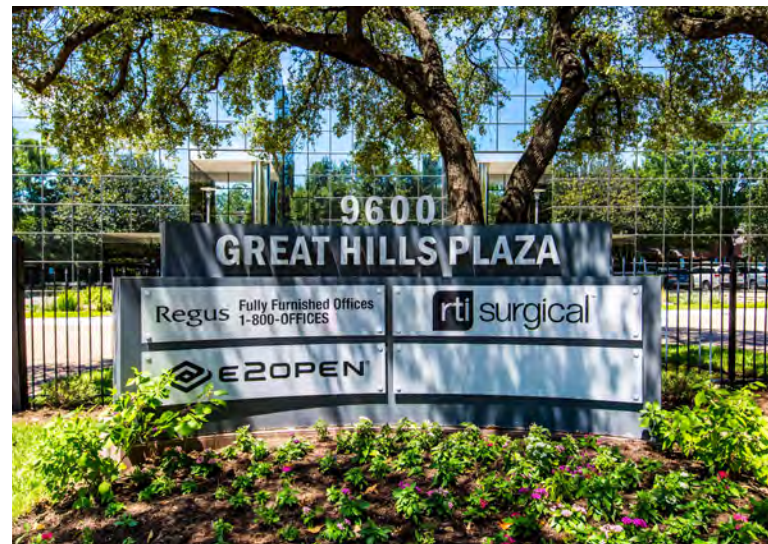
Clockwise from left: Lobby with 3-story atrium, elevators, monument signage