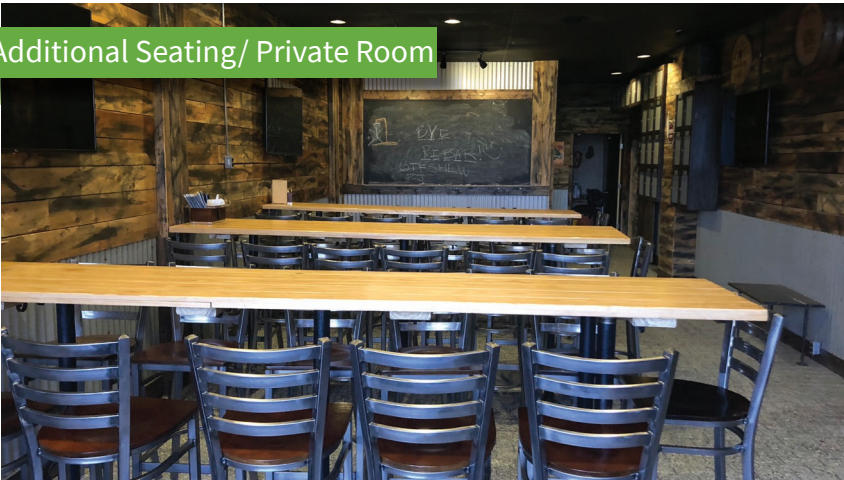
Additional Seating/ Private Room