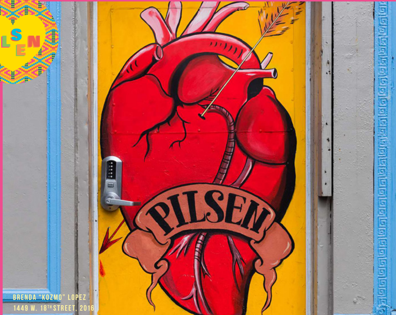
BRENDA "KOZMO" LOPEZ 1449 W. 18 TH STREET, 2016

Blended and full of diversity, Pilsen features offbeat vintage shops, galleries, and independent coffee houses alongside world-class restaurants serving everything from authentic Mexican cuisine to high-end restaurants run by award-winning chefs.