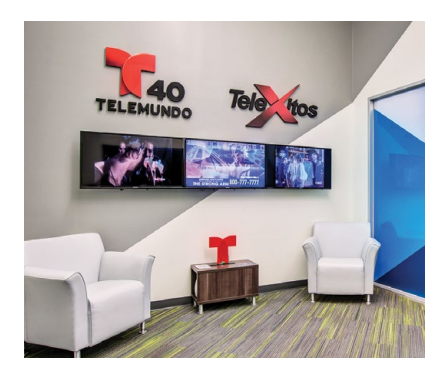
Telemundo – 2<sup>nd</sup> Floor