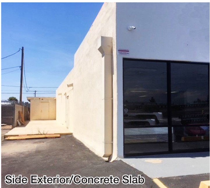
Side Exterior/Concrete Slab