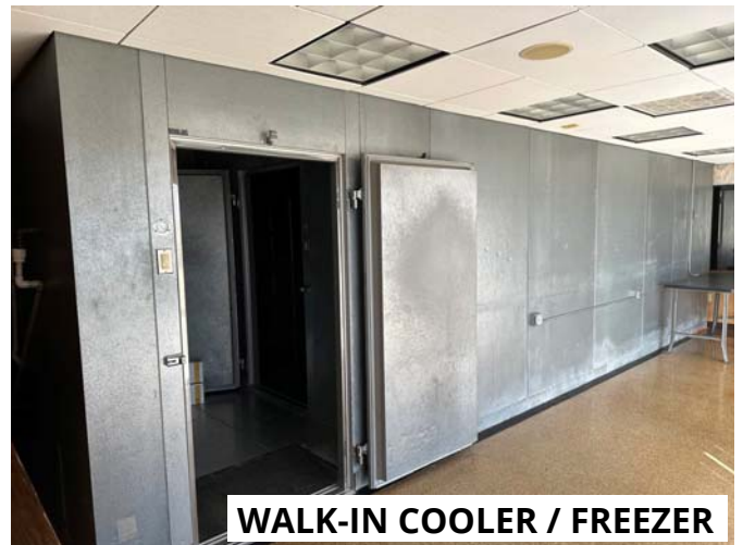
WALK-IN COOLER / FREEZER