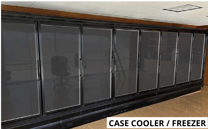
CASE COOLER / FREEZER