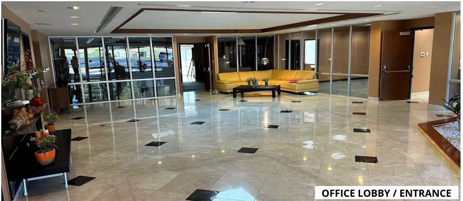
OFFICE LOBBY / ENTRANCE