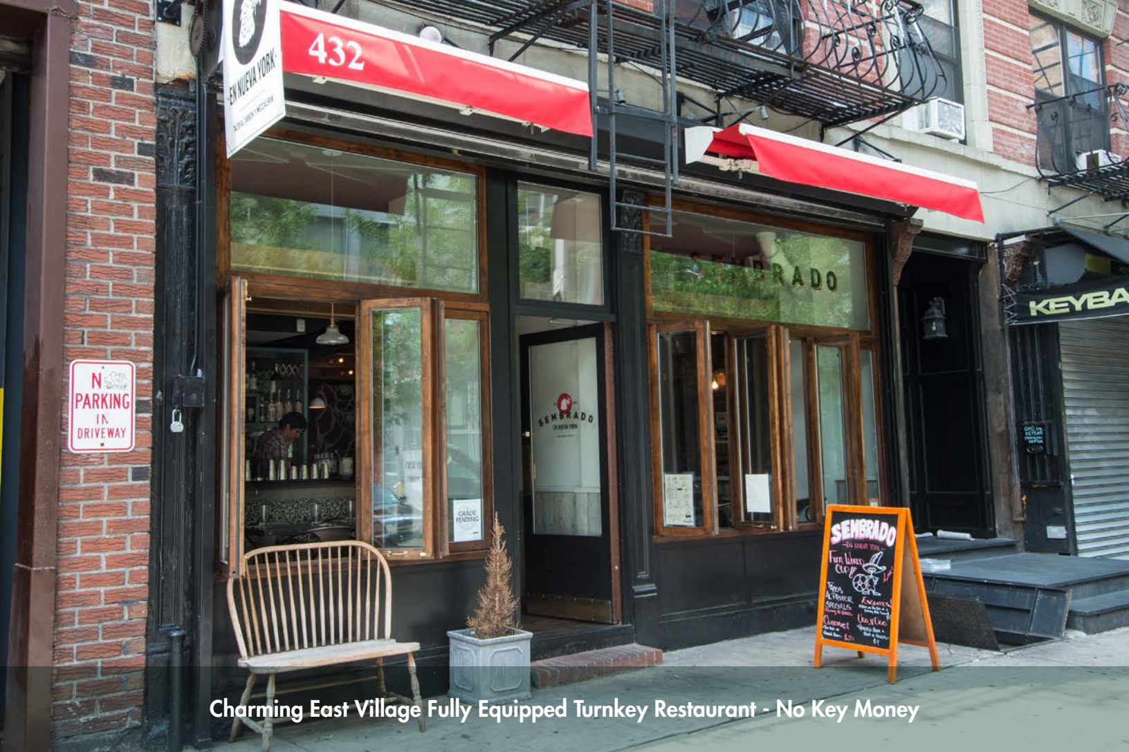
Charming East Village Fully Equipped Turnkey Restaurant - No Key Money