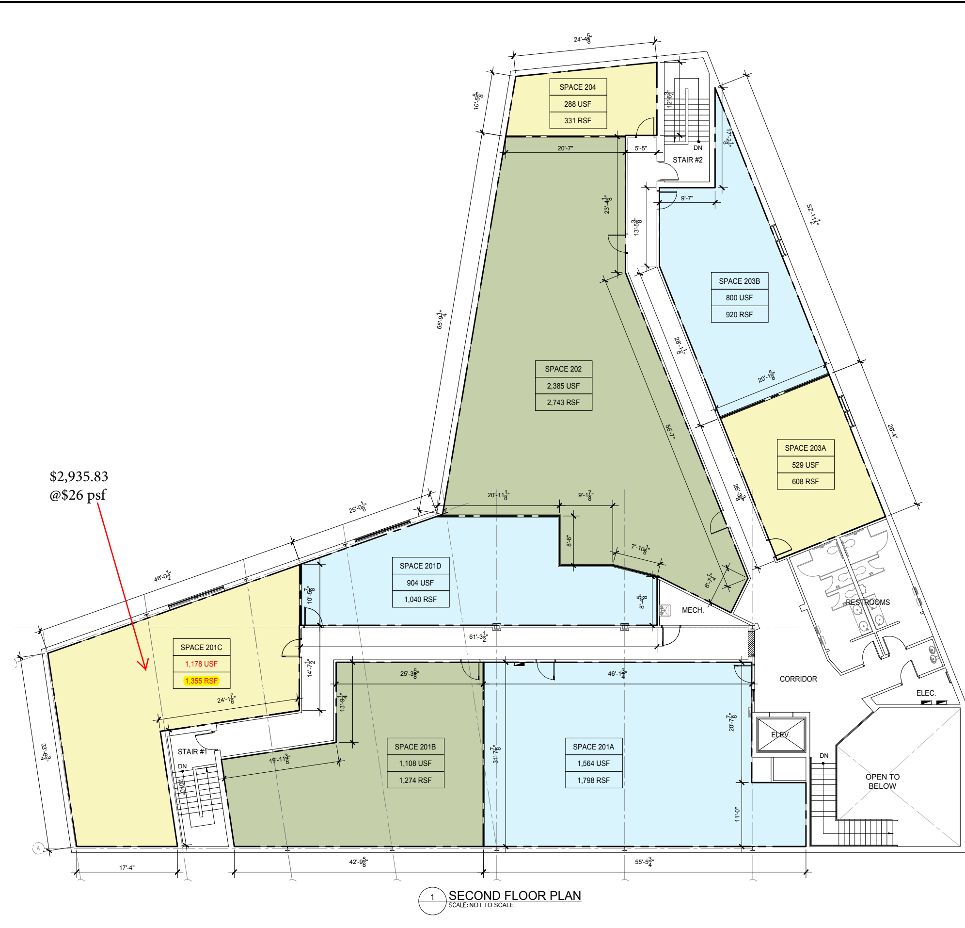
1 SECOND FLOOR PLAN SCALE: NOT TO SCALE