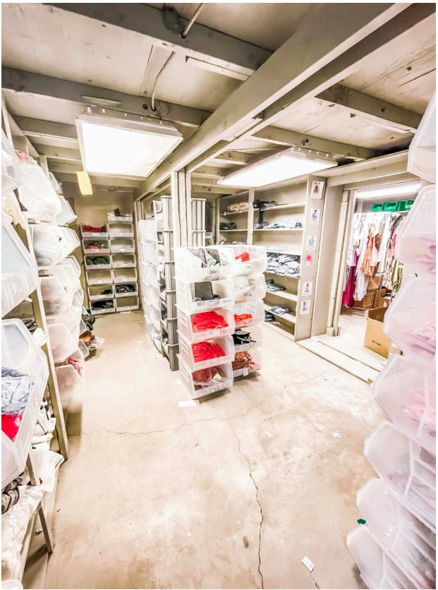
Interior Photos: Storage area and work space, some of which include built in shelving.

Lexie Swiercinsky Office: 972.771.7577 Cell: 469.651.9312 Leads@skyrei.com