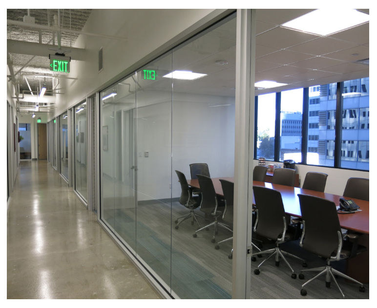
Cushman & Wakefield Copyright 2018. No warranty or representation, express or implied, is made to the accuracy or completeness of the information contained herein, and same is submitted subject to errors, omissions, change of price, rental or other conditions, withdrawal without notice, and to any special listing conditions imposed by the property owner(s). As applicable, we make no representation as to the condition of the property (or properties) in question.