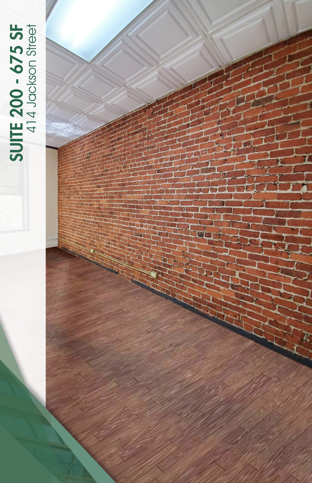
SUITE 200 - 675 SF 414 Jackson Street