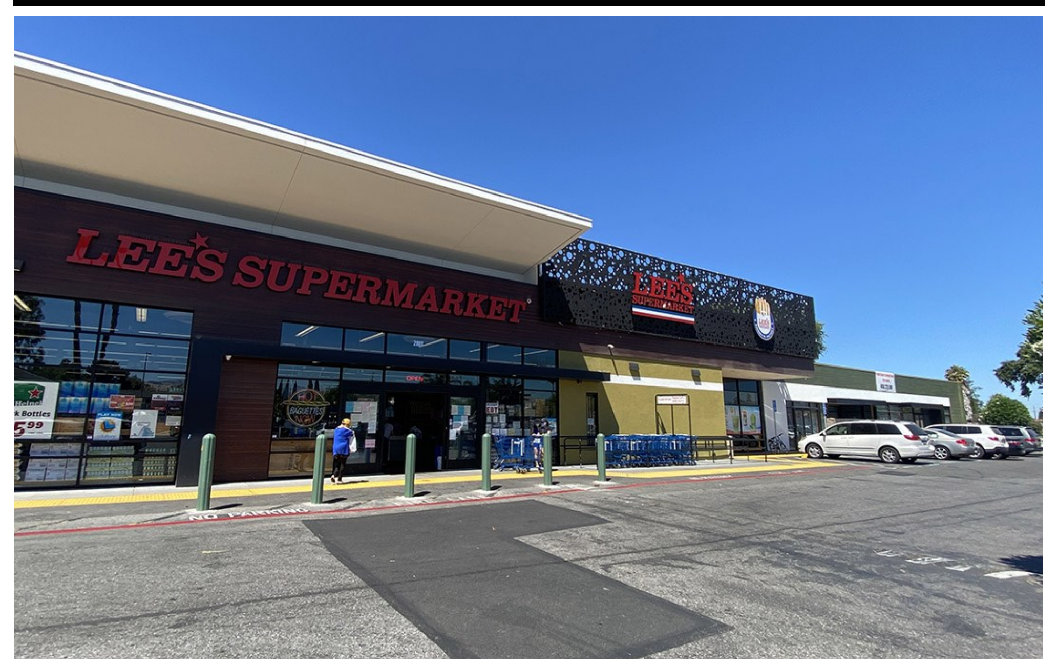
The information contained herein has been obtained from sources we deem reliable. We cannot, however, assume responsibility for its accuracy.