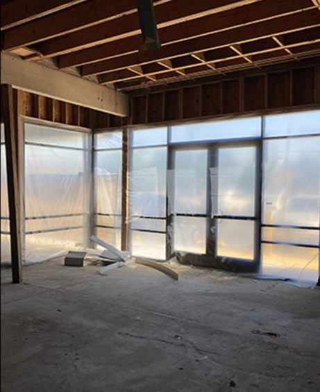
The information contained herein has been obtained from sources we deem reliable. We cannot, however, assume responsibility for its accuracy.