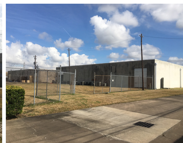
CLOCKWISE FROM TOP: Aerial view // Warehouse interior // Outside storage yard // Grade level loading doors // Warehouse interior