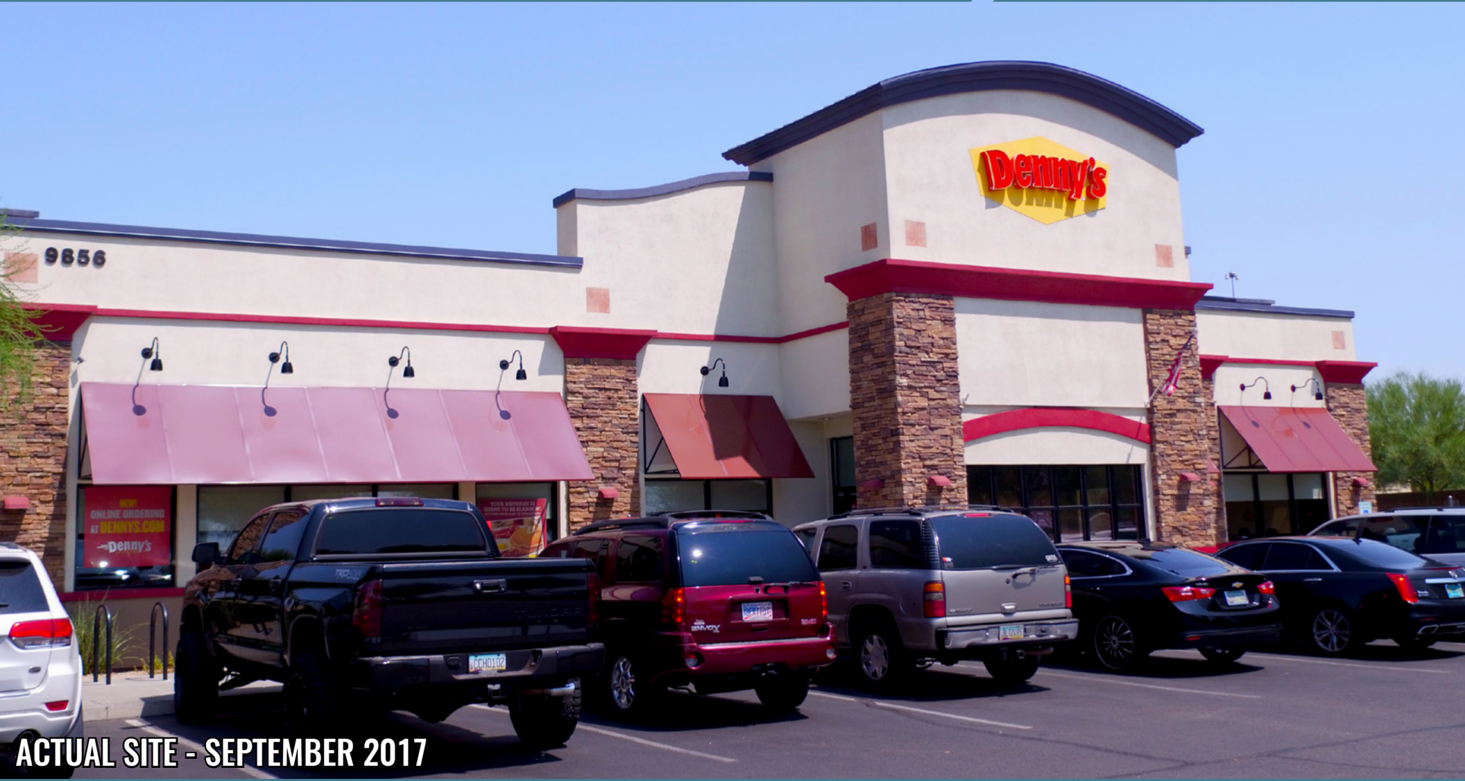
ACTUAL SITE - SEPTEMBER 2017