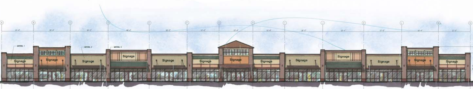
① SOUTH ELEVATION SCALE: 3/32" = 1'-0"

10620 PACIFIC HWY. SW • LAKEWOOD, WASHINGTON • 98499