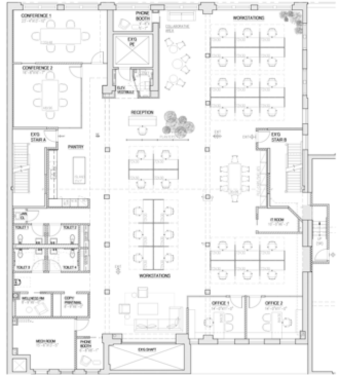
PROPOSED 3RD FLOOR PLAN – 8,974 RSF