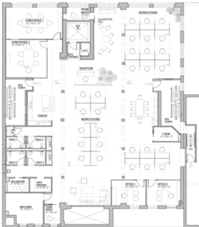
PROPOSED 4TH FLOOR PLAN – 9,033 RSF