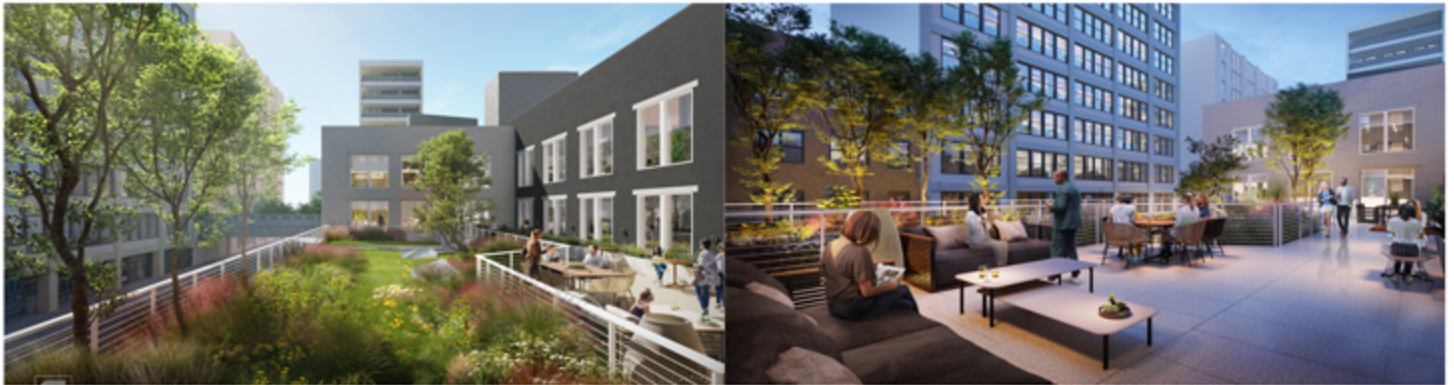
Private roof terrace