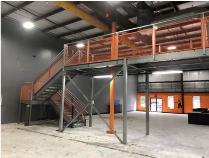
Stairs to Mezzanine