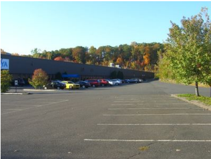
13 Francis Clarke Park - Bethel