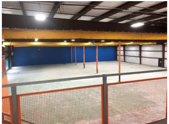
View From Mezzanine