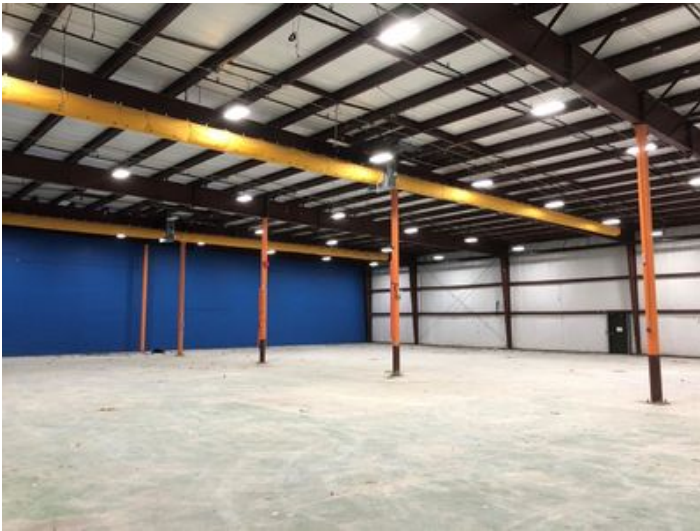
Large Open Warehouse Space