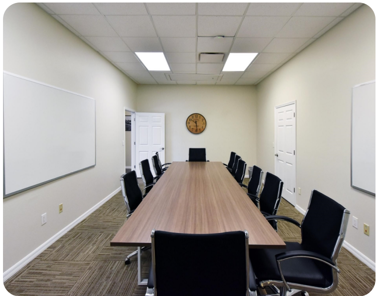
Conference Room (front to back)

Market: Tampa/St. Petersburg Submarket: Northeast Tampa Available: 2,380 SqFt Space Type: Administrative Year Built: 2004