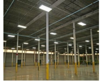
NEW T-8 LIGHTING