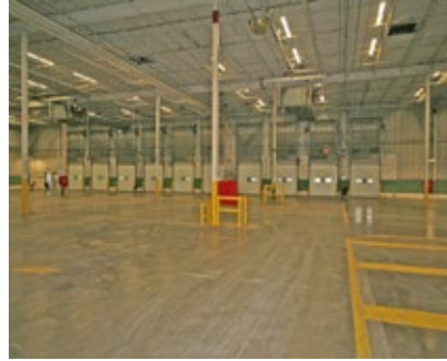
10 FULLY EQUIPPED 9' X 10' DOCK DOORS