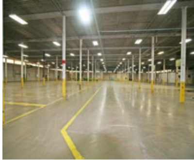
PRODUCTION WAREHOUSE 84,000 SQ. FT.