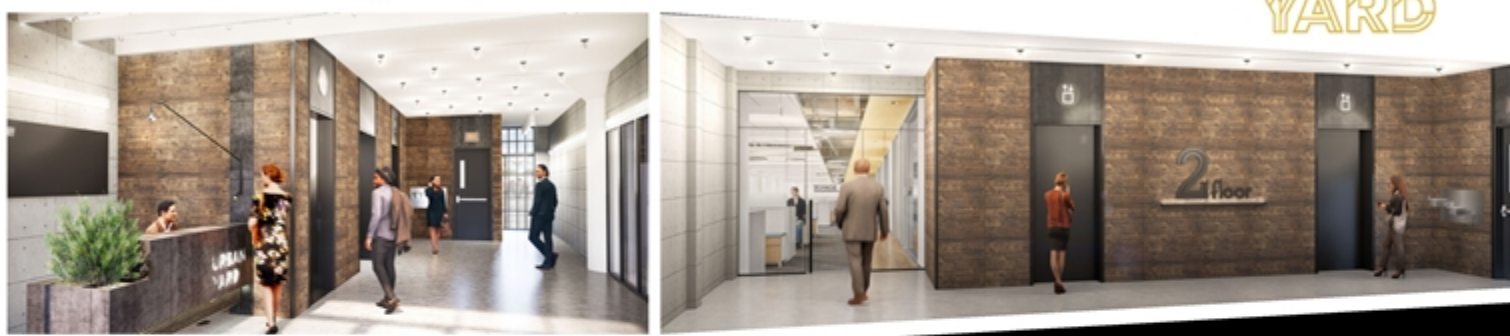
PROPOSED OPEN OFFICE LAYOUT