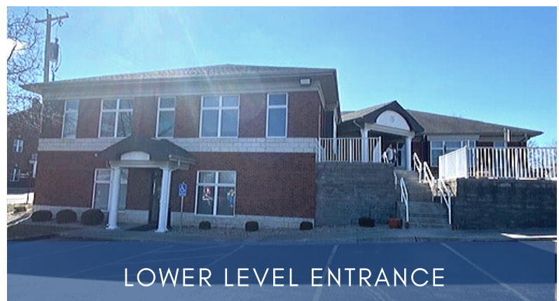
LOWER LEVEL ENTRANCE